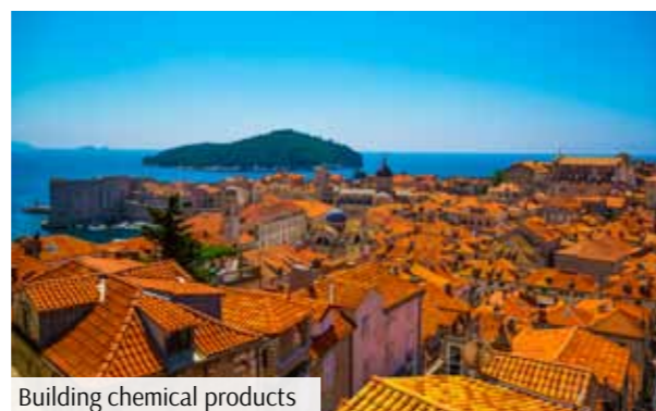
Building chemical products